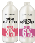
Crème Developer 3% (10 Vol) & 6% (20 Vol)