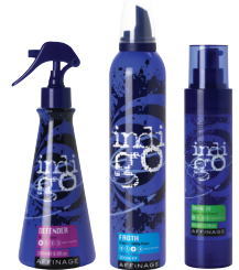
Indigo Styling & Finishing