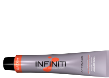
Infiniti 9.035, 9.1, 8.035, 7.036, 6.036