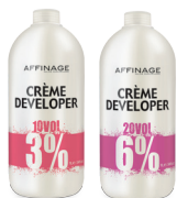
Crème Developer 3% (10 vol) & 6% (20 Vol)