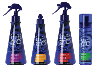
Indigo Styling & Finishing